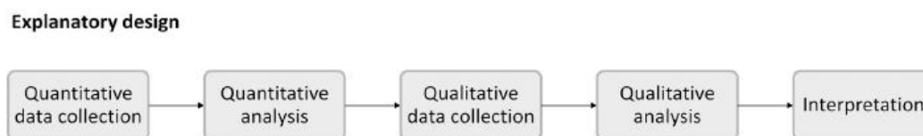
Figure 1. Mixed-method design and procedures of the study

design was employed. This type of design, as elaborated on by Creswell and Clark (2011), starts with a quantitative phase in which the researchers, firstly, collect and analyzes the collected data. Then, the collected data of this phase will be used to carry out the qualitative part of the study for data collection and analysis. The two phases are of paramount significance, and none of the them prioritize the other one when addressing the study's research questions. More specifically, as pointed out by Ivankova et al. (2006), this phase facilitates the explanation of the results of the quantitative phase by probing the perspectives of the participants in more details.